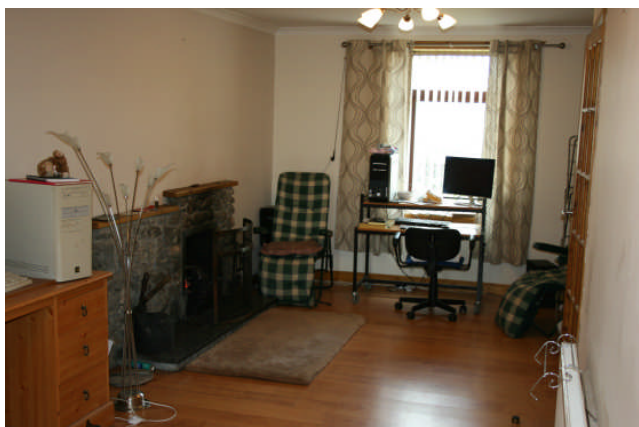
Living Room 1