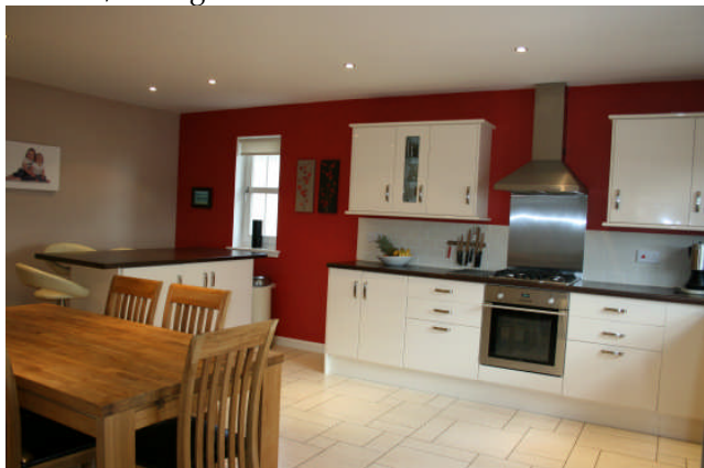
Alternative view of Kitchen/Dining Area