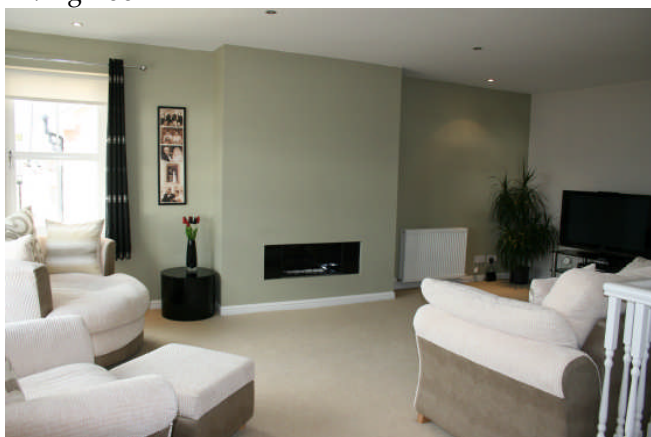
Alternative view of Living Room