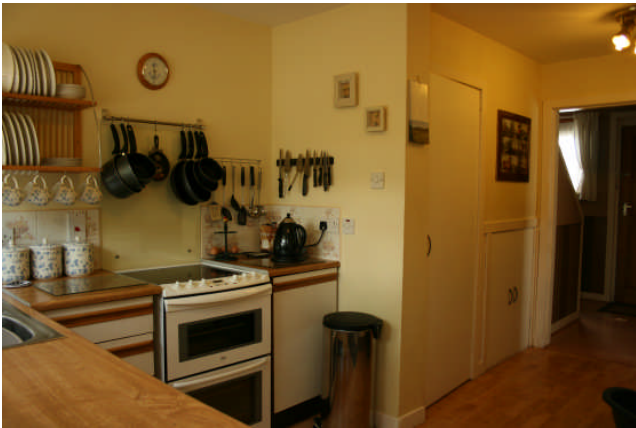
Alternative view of Kitchen