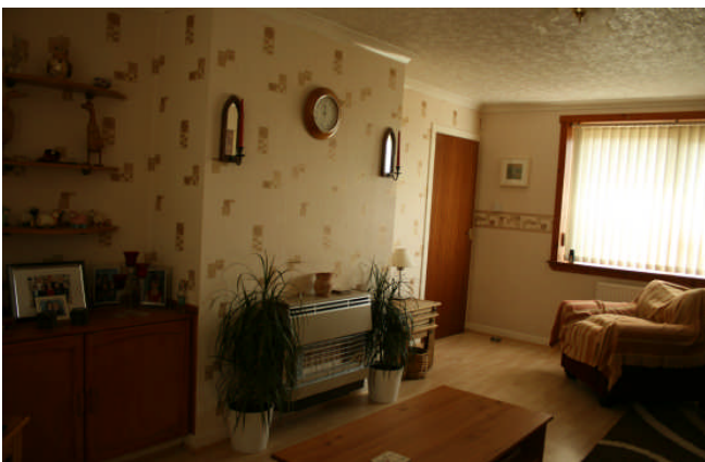
Alternative view of Living Room