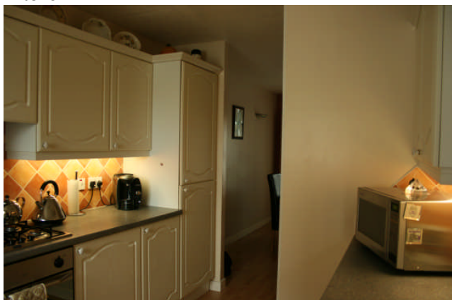
Alternate view of Kitchen